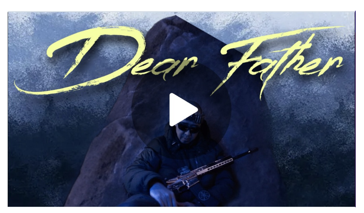
Dear Father Music Video