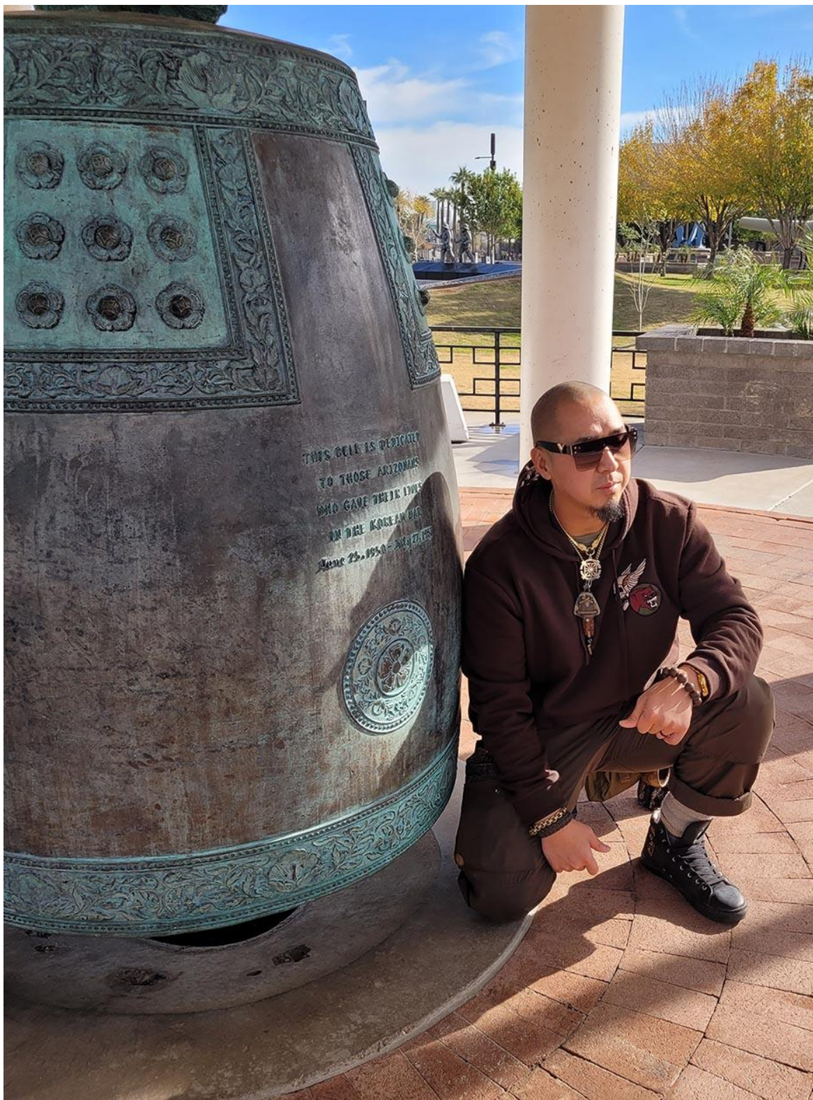
Korean War Memorial at Arizona Statehouse