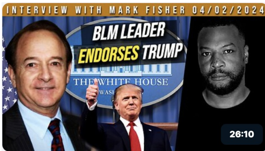
BLM Leader Endorses Trump Interview