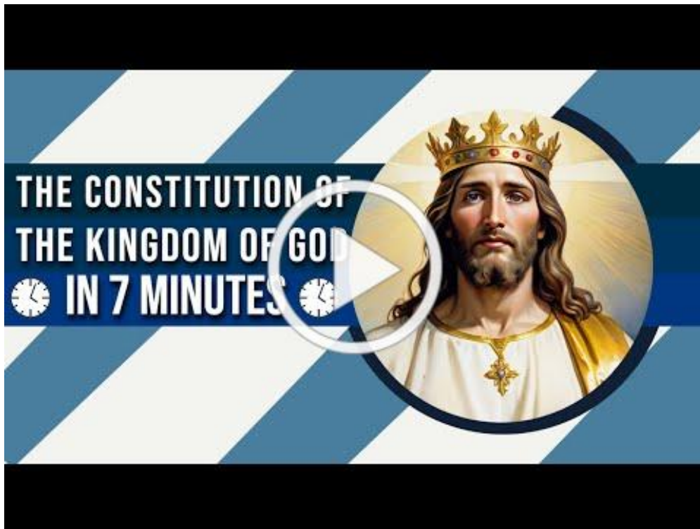
Constitution of the Kingdom of God in 7 Minutes