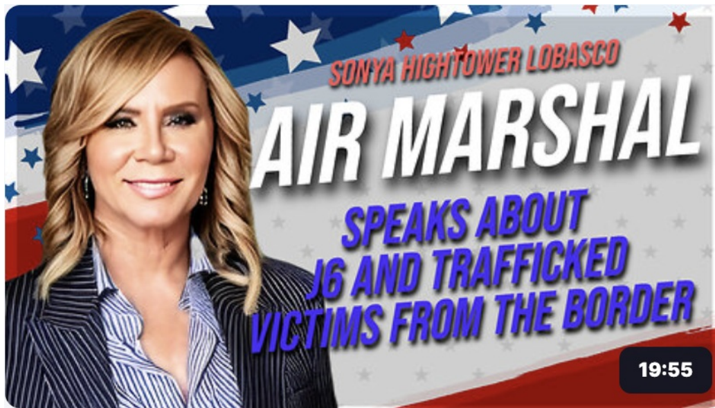
Air Marshal on Border Trafficking Interview