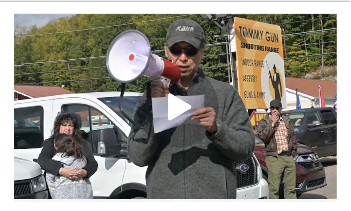
We the People - Trump Rally to Take Back America

Those who have escaped Communist countries can see what is happening. But more people are waking up. We need to train, strengthen our mind-body unity. You can make continual improvement whatever age you are.