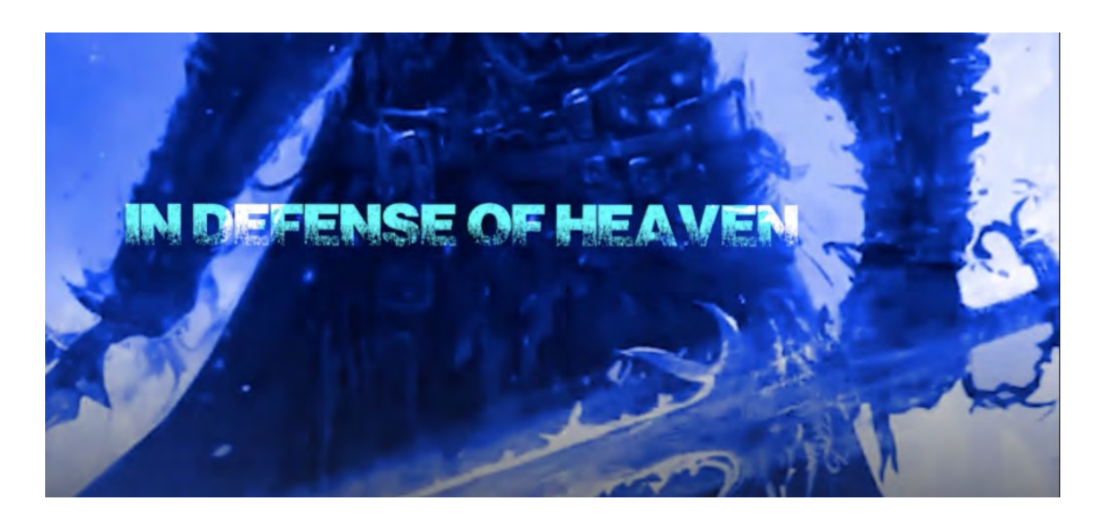
Defending Liberty & the 2nd Amendment

NEW Sanctuary Publication: The History of Unification Sanctuary, 2015-2016 is a compilation of essays, testimonies and sermon summaries sent out to the English-speaking Unification community during an historic, tumultuous time in God's providence. <u>Download</u> on Sanctuary Resources History tab, or order in <u>Kindle format or printed</u>.