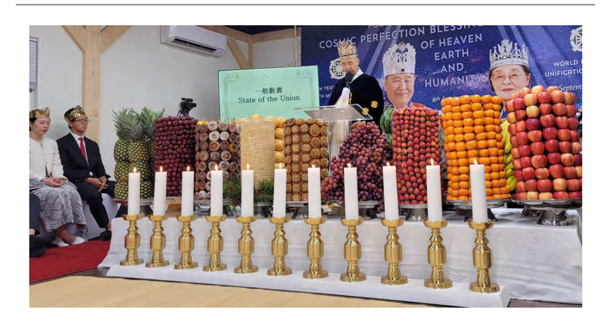
<u>Cosmic Perfection Blessing of the True Parents</u> <u>of Heaven, Earth and Humanity</u>

All of these Biblical commentators expected something stupendous to take place on September 23, 2017, but it came and went without a supernatural event. Except of course, something DID happen, the worldwide news coverage of Cosmic Blessing of the True Parents of Heaven, Earth and Humanity , and the launch of Rod of Iron Kingdom, with its challenge to the totalitarian system based on disarmament at the Sanctuary Church in Newfoundland, PA.