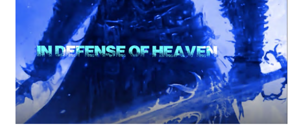
Defending Liberty & the 2nd Amendment