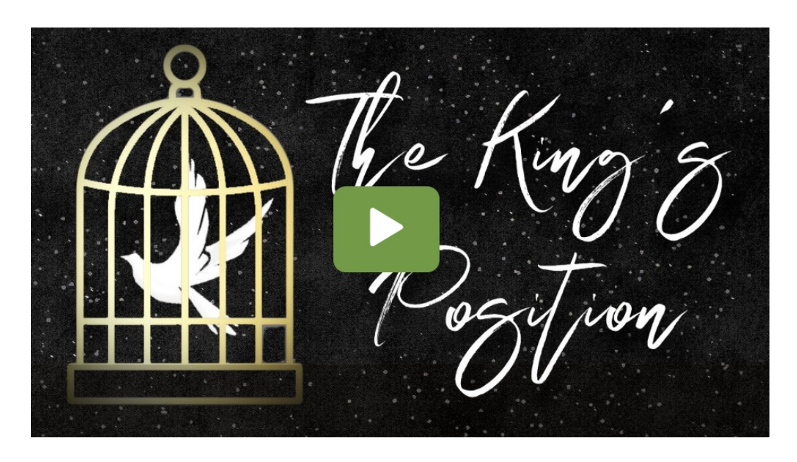
Sanctuary Service 4/30/2023

a sentence at Danbury prison (for alleged failure to pay $7,000 in taxes over a 3 year period).