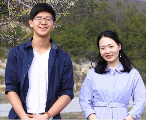
Contribute to 3rd King's Parsonage