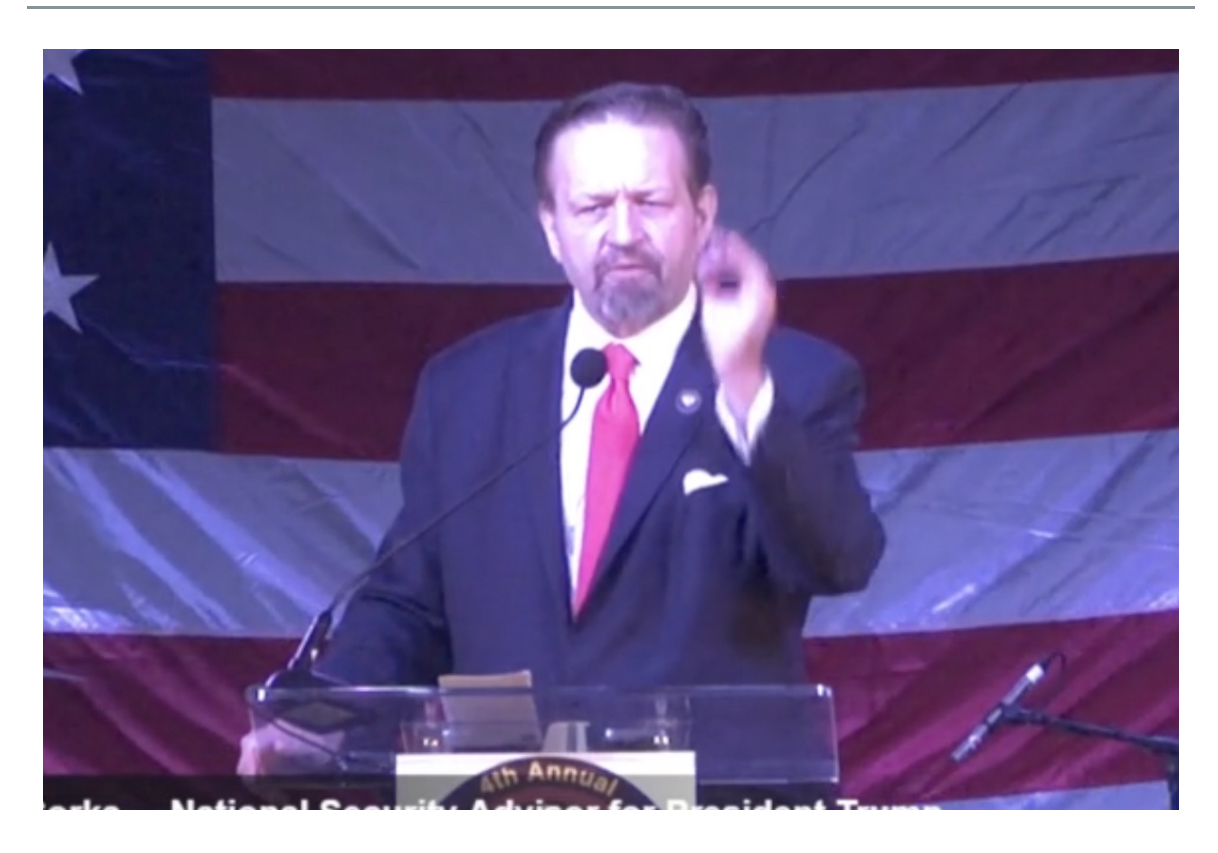
Rod of Iron Freedom Festival Opening Ceremony 10/8/2022

(read rest of ROI FF Founder's Address )