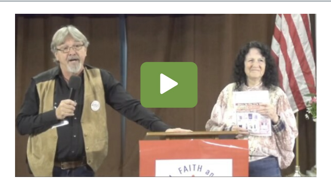
Save the Nation Conference Session 1, 10/7/2022