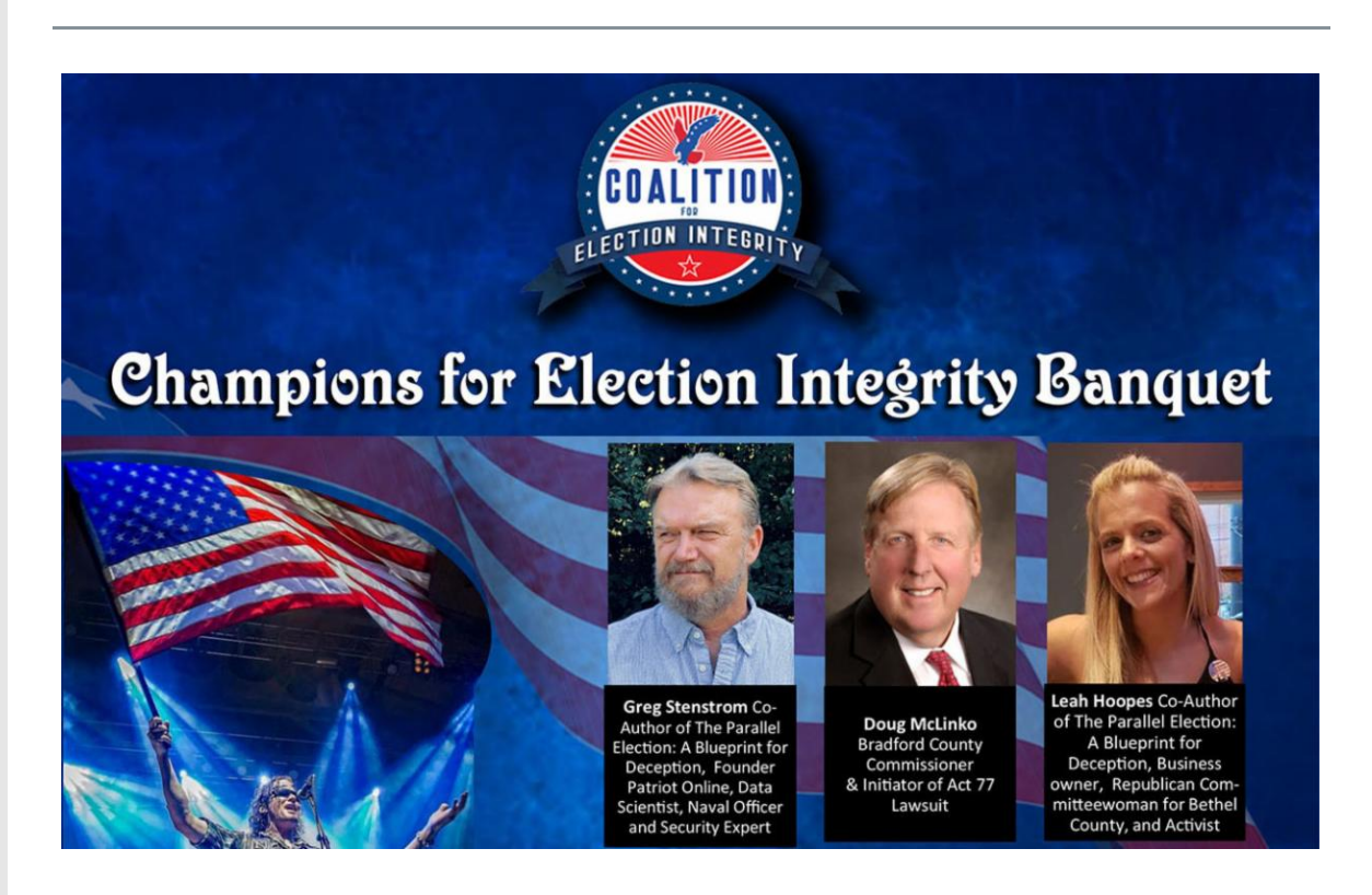
Election Integrity Awards Banquet - Pt 1 Video