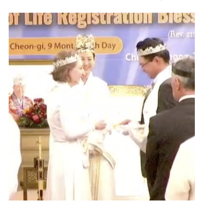
Book of Life Registration Holy Blessing 10/14/2022

The ROI Freedom Festival encourages people to open carry their firearms in order to honor the culture of self-defense. As discussed in the Rod of Iron Kingdom book, <u>EACH DAY in the US there are 500 DEFENSIVE uses of firearms by civilians</u>. Why does the Mainstream Media almost never report about that? We all know they are not committed to report objectively.