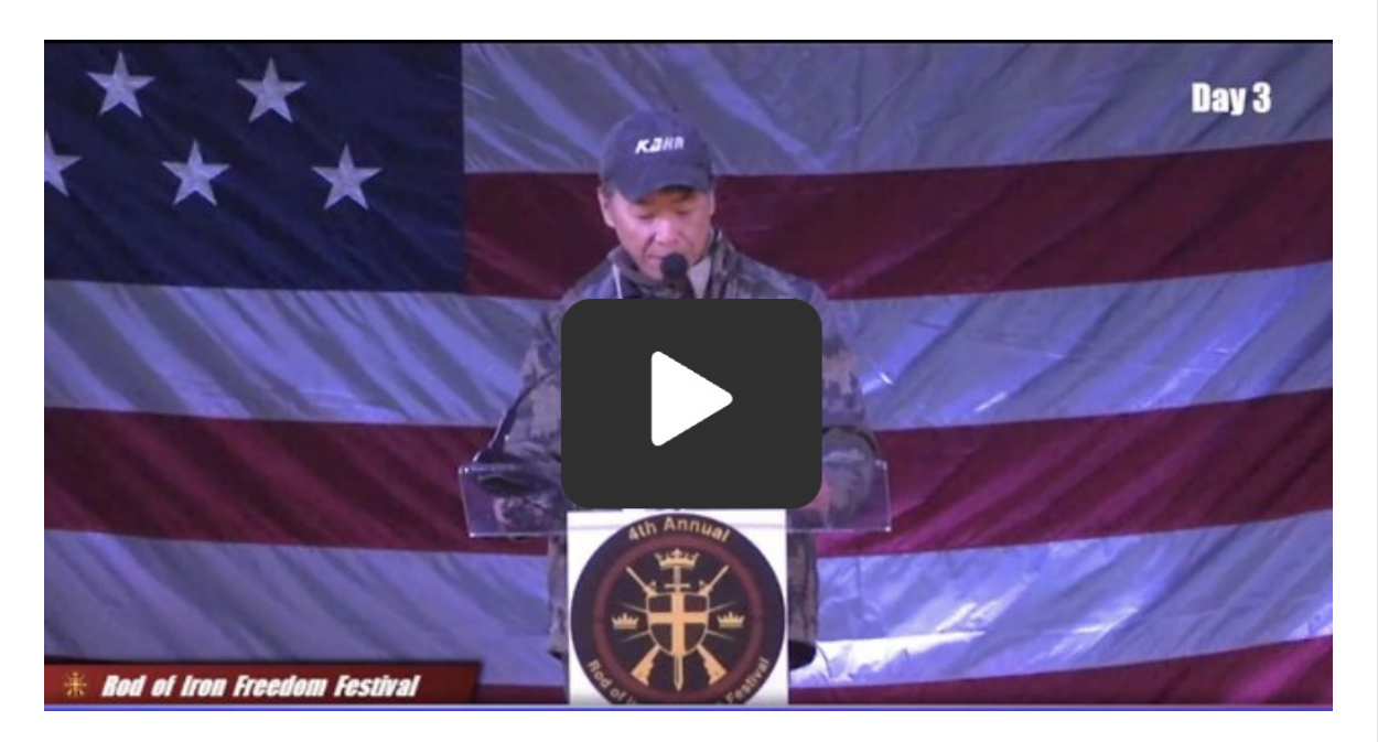
Rod of Iron Freedom Festival Opening Ceremony 10/9/2022

Finalists in the Rod of Iron Art contest were recognized, the winner of the Trump AR15 raffle announced and the Japanese Task Force Choir gave a resounding rendition of Battle Hymn of the Republic. The day concluded with a Bonfire Finale.