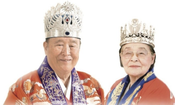
Heavenly Calendar for the 15th Year of Cheon-gi