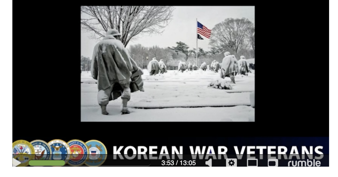
Korean War Memorial Dedication at the ROI Freedom Festival