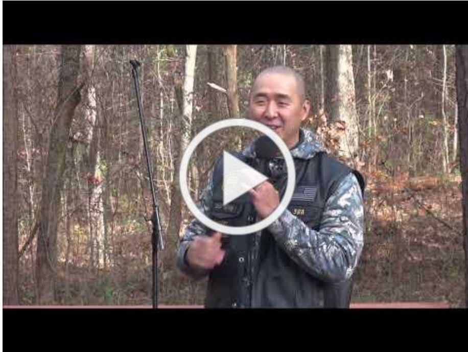
Open Air Service at Panola Park in GA 12/6/20

The Bible recognizes that all men have sin. The law given in the Hebrew Bible reveals our sin so that none of us can boast, but when we accept the victory of Christ, then God views us as having taken on the Christian's nature.