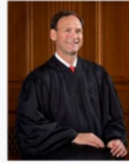
Samuel Alito, Associate Justice since January 31, 2006 Age 70 [15]