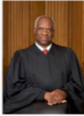
Clarence Thomas, Associate Justice since October 23, 1991 Age 72 [13]