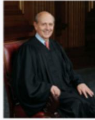
Stephen Breyer, Associate Justice since August 3, 1994 Age 82 [14]