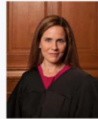
Amy Coney Barrett, Associate Justice since October 27, 2020 Age 48 [20]