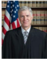
Neil Gorsuch, Associate Justice since April 10, 2017 Age 53 [18]