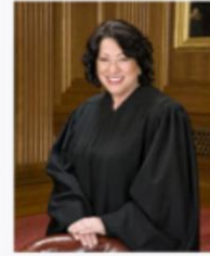
Sonia Sotomayor, Associate Justice since August 8, 2009 Age 66 [16]