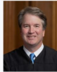
Brett Kavanaugh, Associate Justice since October 6, 2018 Age 55 [19]