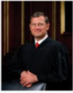
John Roberts, Chief Justice