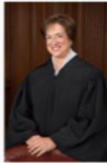
Elena Kagan, Associate Justice since August 7, 2010 Age 60 [17]