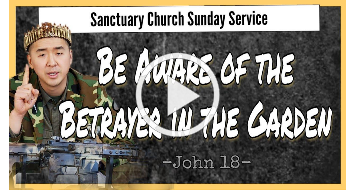
Sanctuary Church Sunday Service 3/1/20

Many religions teach to avoid all stress, but healthy stress is good for your immune system. One of his sons, who felt a sore threat coming on, jumped in the frozen Koi pond for one minute of ice training. He was hesitant, but once he was in, it wasn't so bad. Afterwards his whole body felt revitalized.