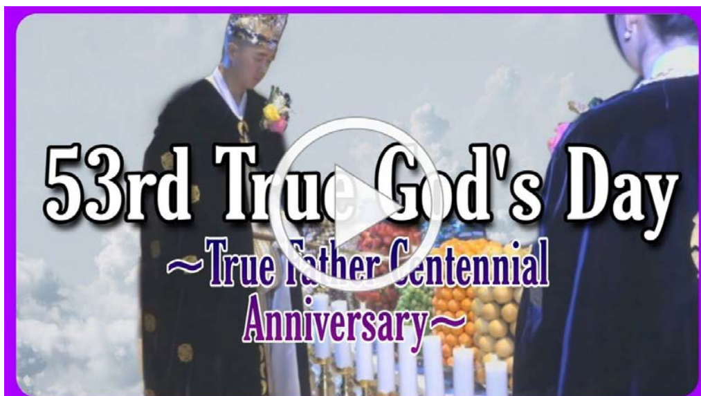
53rd True God's Day ( True Father's Centennial Anniversary) 1/25/2020