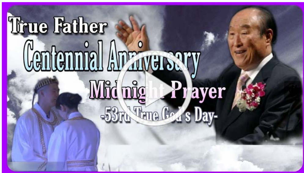
53rd True God's Day Midnight Prayer 1/25/2020 (True Father's Centennial Anniversary)

On the next day, Hyung Jin Nim started the first Sunday service of this new year by discussing the text in Matthew 4 where the devil mocks and challenges Jesus, saying "you're a child of God, why don't you turn these stones into bread?" Jesus responded, "I will only serve God." Satan wants us to deny our identity as the heirs of Christ and sons of God. But if we deny Father, lose our identity, then Satan can take everything away.