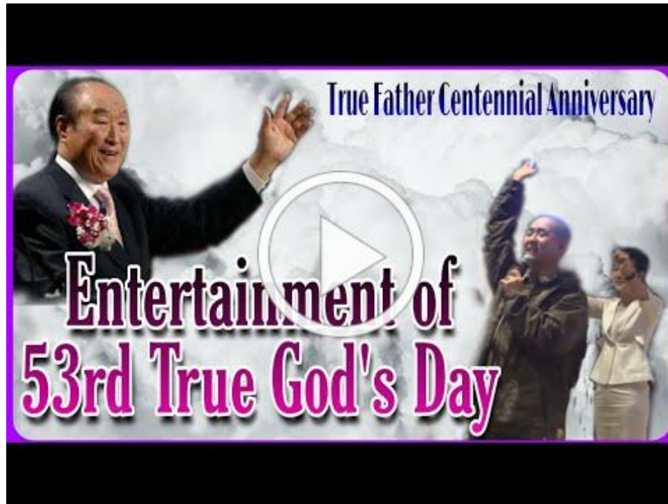
Entertainment of 53rd True God's Day 1/25/2020

Our Blessing ring represents Heaven's wedding ring. It does not matter what it is made of. It is not based on our own merit.