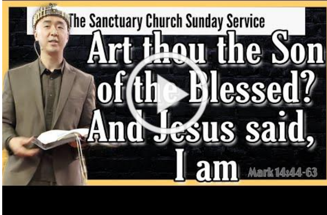
"Art thou the Son of the Blessed?" And Jesus said, "I Am" Sanctuary Church Sunday Service 1/12/20

We are surrounded by people of good will, who may not understand everything, but trust and want to support us. We represent God's authority. Many are ex-military who watch to see what we are really about. Our situation is mild compared with the time of Jesus, when they rounded up followers of Jesus to stone and kill them.