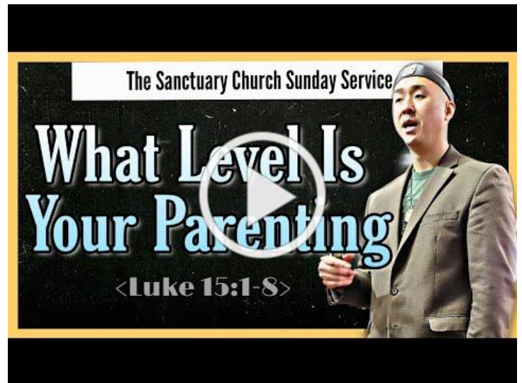
What Level Is Your Parenting? (Sunday Service 12/22/19)