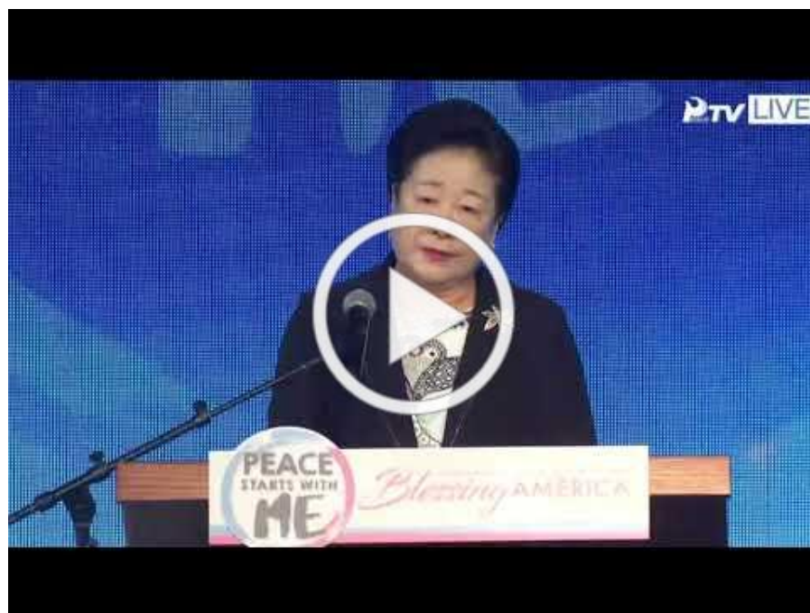
4/6/19 HJH: "In 1960 I ascended to position of TPs"

No mention of who was the "lucky guy" she was blessed to. No mention who invited her to participate in the Blessing. No mention that Jesus called Sun Myung Moon to complete his work in 1935, eight years before she was born. No gratitude shown to True Father walking the path of suffering to establish the foundation she could join in 1960.