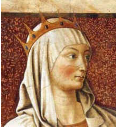
Queen Esther in the Bible

For he is the minister of God to thee for good. But if thou do that which is evil, be afraid; for he beareth not the sword in vain: for he is the minister of God, a revenger to execute wrath upon him that doeth evil. Romans 13:4