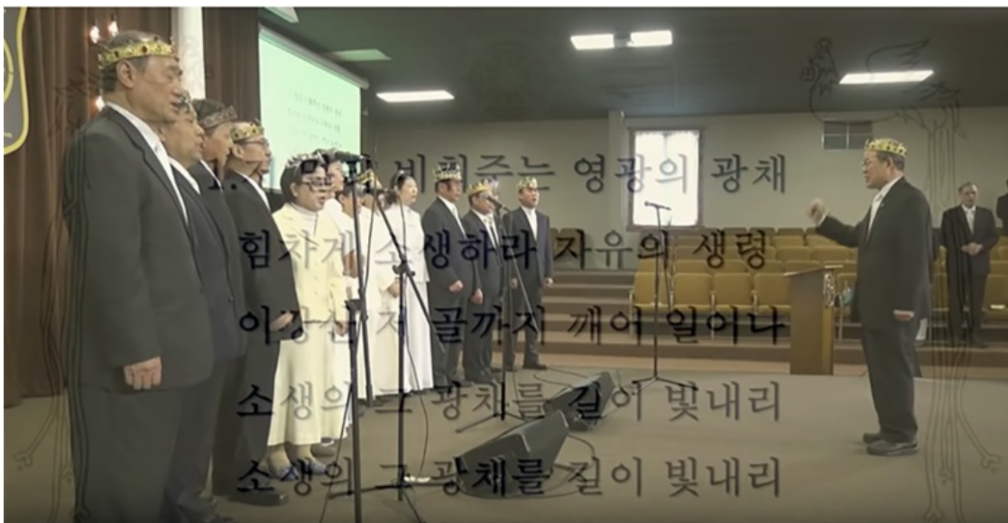
Hyung Jin Nim's Message re: Preparation for True Mother Kang's Seonghwa 3/10/2019

That doesn't change now that she has gone to spirit world. The Asian and Catholic tradition is to venerate ancestors (saints), but that is not biblical. It is idol worship. Those that take up goddess worship lose their fear of God the Father. The Archangel invades through focusing on the goddess. Historically that led to temple prostitution and exploitation of women through free sex, and fatherless boys often growing up to become criminals.