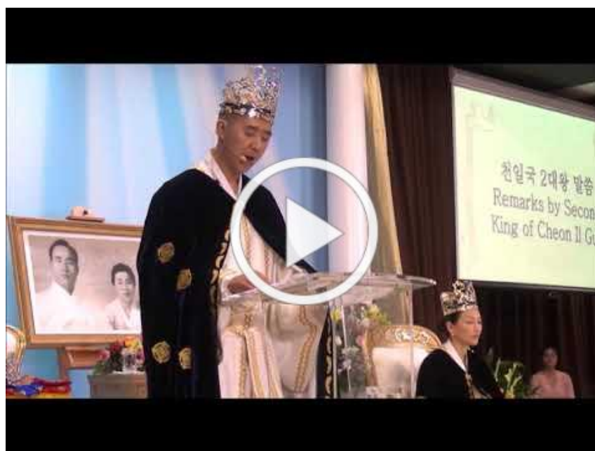
True God's Day 2019, Cheon Il Guk Second King's Remarks