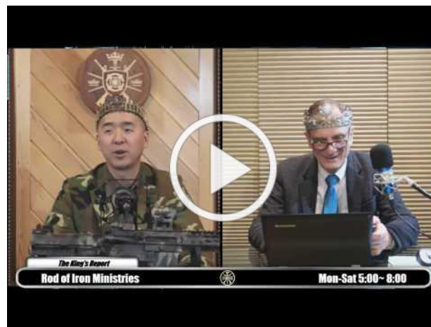
In 2/11/19 King's Report, Hyung Jin Nim's ABSOLUTE SEX Guidance