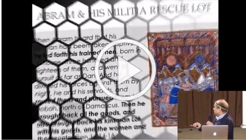
R Panzer- What the Bible REALLY Says about Violence