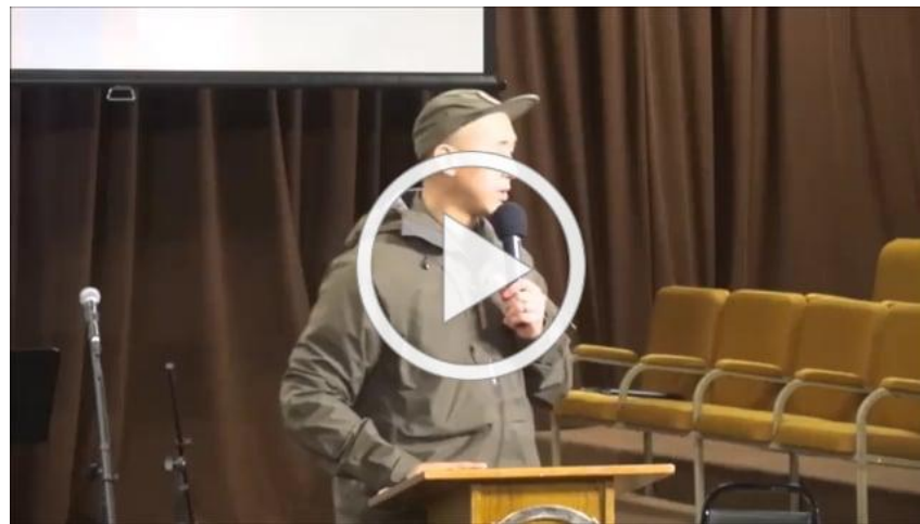
Hyung Jin Moon 2/5/19 Festival "Brave Christians" Talk