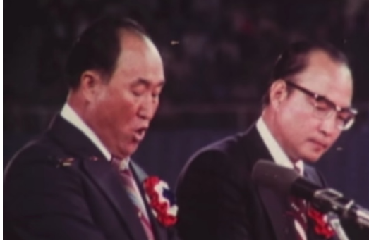
Rev. Sun Myung Moon & Bo Hi Pak at God Bless America Festival 1976

And I looked, and arose and said to the nobles, to the leaders, and to the rest of the people, "Do not be afraid of them. Remember the Lord, great and awesome, and fight for your brethren, your sons, your daughters, your wives, and your houses." Nehemiah 4:14