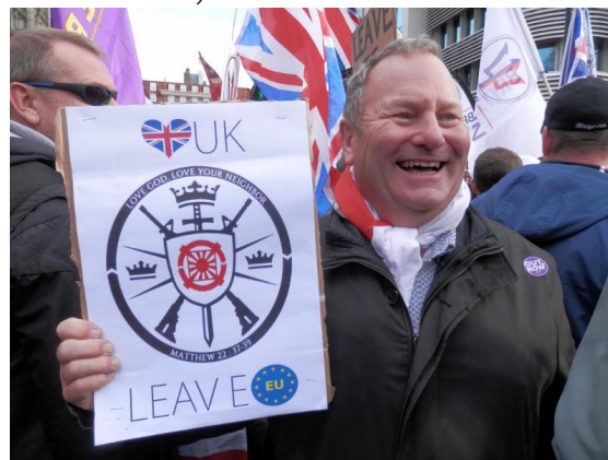
Brexit Supporter Holding Rod of Iron Kingdom Logo