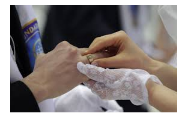
Sanctuary Church Lake House, 139 High Meadow Dr., Milford, PA 18337

Friday, Jan 18, 2019, 6pm to 8pm Saturday, Jan 19, 2019, 9am to 8pm