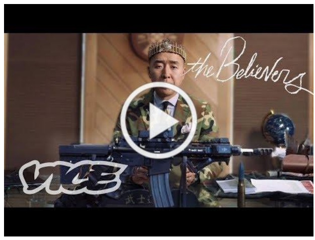
Guns For God: The Church of the AR-15

*I love listening to people shame guns for being weapons of death. As if swords aren't the same thing. Crusades were a pretty Christian thing.