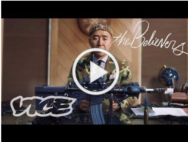
VICE Documentary about Unification Sanctuary

sovereignty and the right to self-defense. Even the Family Fed's millions and lawsuits cannot stop God and True Father from speaking out!