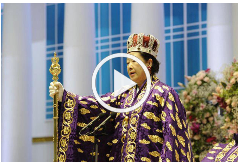
Hak Ja Han's deceptive events targeting Christians