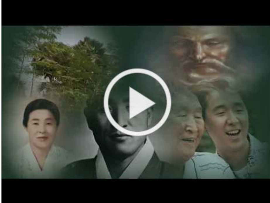
Han mother turns the children away from their Father