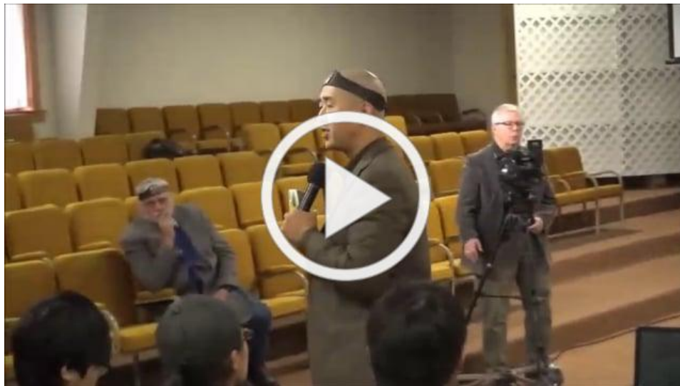
2018-10-28 Highlight - HolySpirit only the beginning of Portion of Responsibility

"Progressive" globalists hate Christianity because it stands for the moral high ground. In Korea under President Moon Je In, the cost of welfare is 33% of the national budget. His government is bringing new mandates that the public schools promote a values-free sex culture, which is an enticing drug to replace real political freedom. If you have multiple relationships you have a higher risk of divorce. Uncommitted sex makes you weaker.