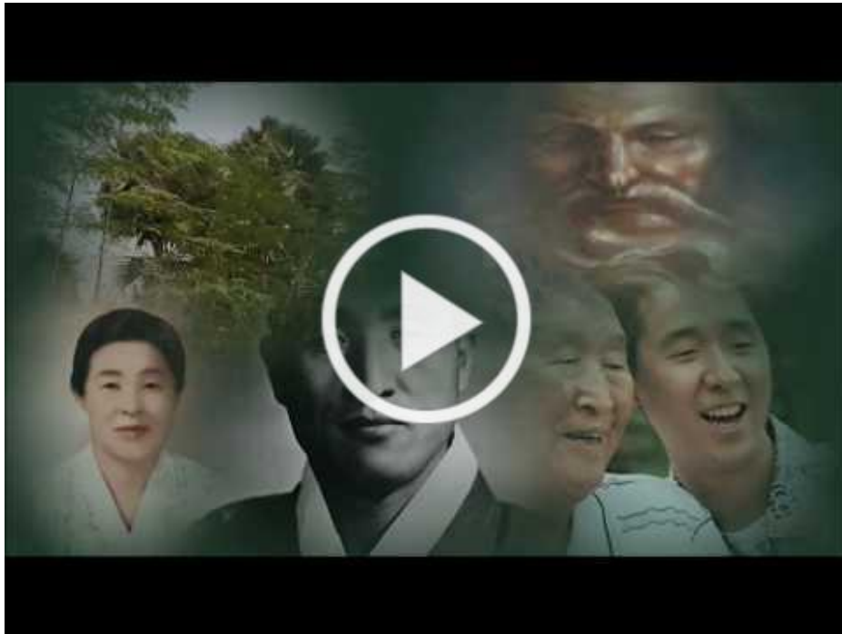
Han mother turns the children away from their Father