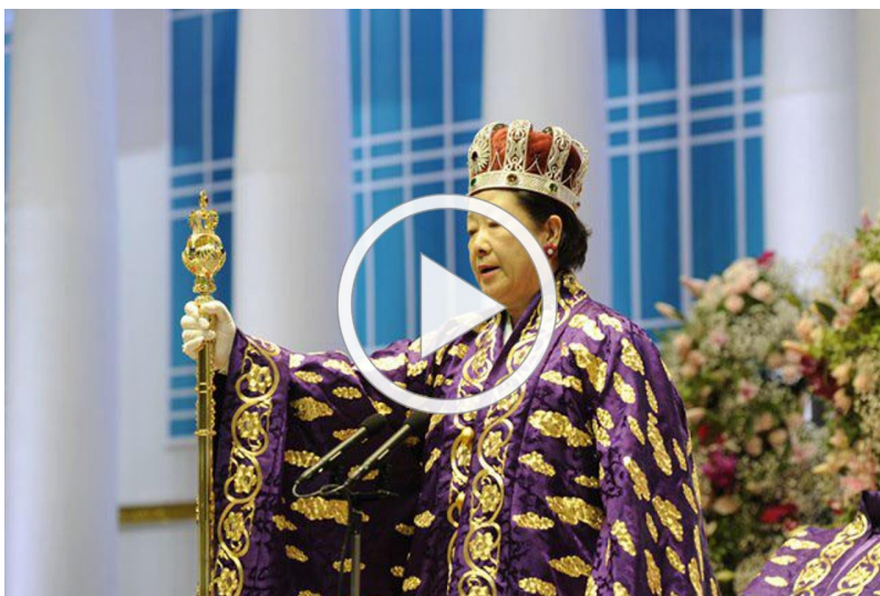
Hak Ja Han's deceptive events targeting Christians