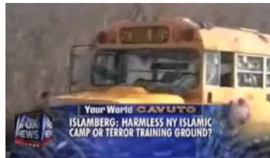
School bus used for target practice in Islamberg in Hancock, NY