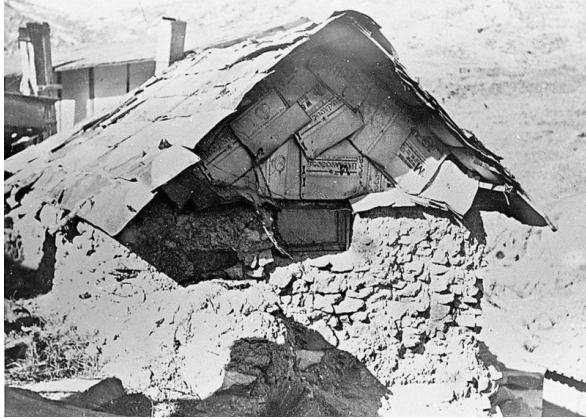
1st Unification Church built by True Father in 1952

Jesus said to them, "Have you never read in the Scriptures: "'The stone that the builders rejected has become the cornerstone; this was the Lord's doing, and it is marvelous in our eyes"? Matthew 21:42