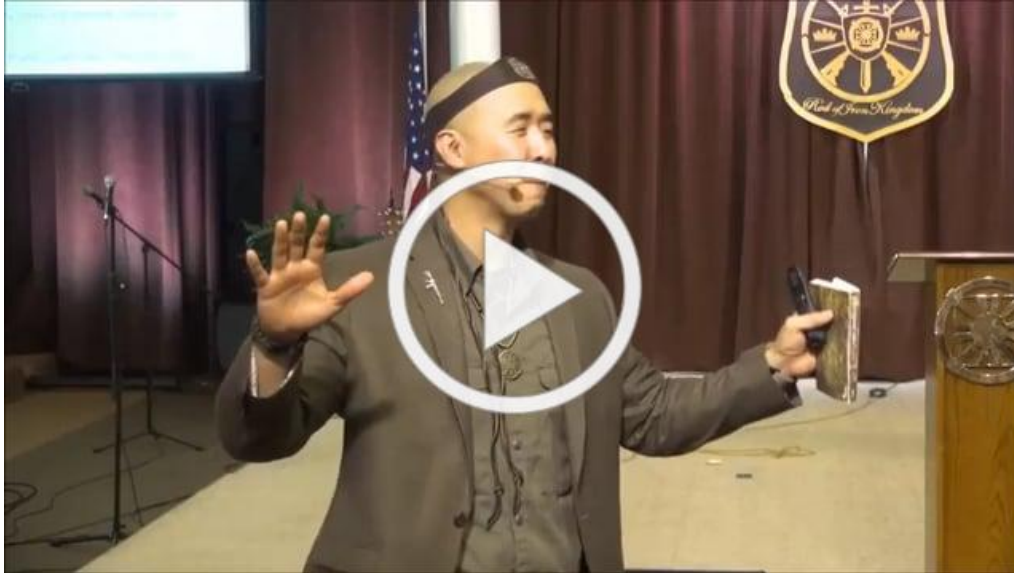
Sunday Service - October 7, 2018 - Rev. Hyung Jin Moon Unification Sanctuary, Newfoundland PA

Elected officials are supposed to be public servants, but often leave their position to become uncaring masters. As George Washington said, "government is force. It is a dangerous servant, and a fearful master." All royalty is heavily armed in order to maintain their power.