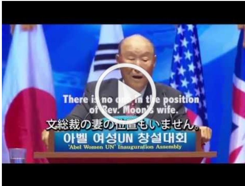
True Father's Abel UN Speech 2012-7-16 "No Mother"

shown to the Han Mother that "there is no one in the position of Rev. Moon's wife." She testifies that she was not aware of these words