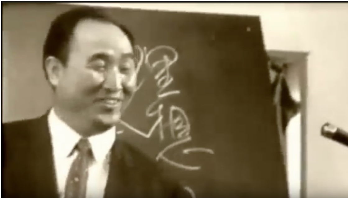
Finding Father Video

Six years after his ascension to the spirit world, the Unification Sanctuary celebrated the victorious life and ministry of Sun Myung Moon, who came as the True Parent and Lord of the Second Advent awaited by the followers of Christ for 2,000 years.