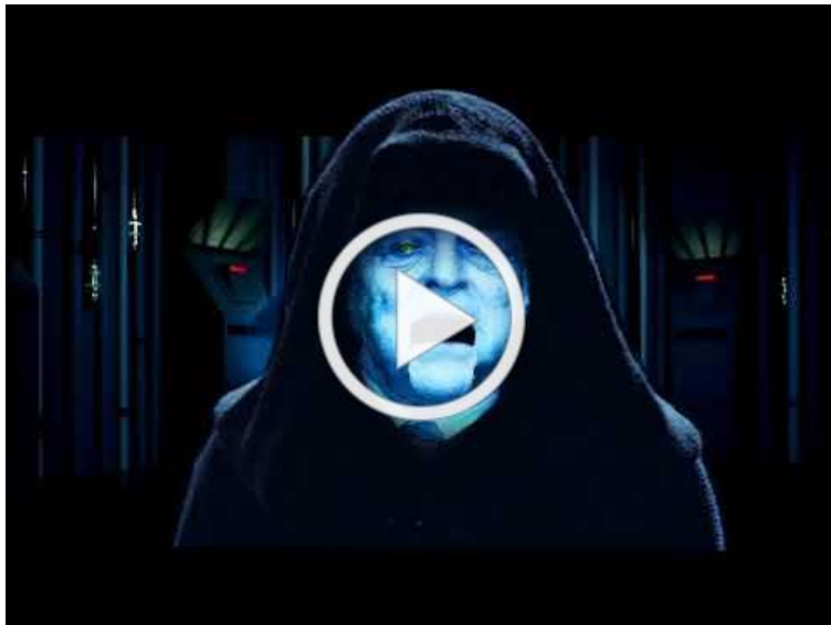
George Soros feels a disturbance in the Force!