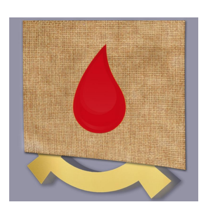
Rod of Iron Ministries

World Peace and Unification Sanctuary - USA