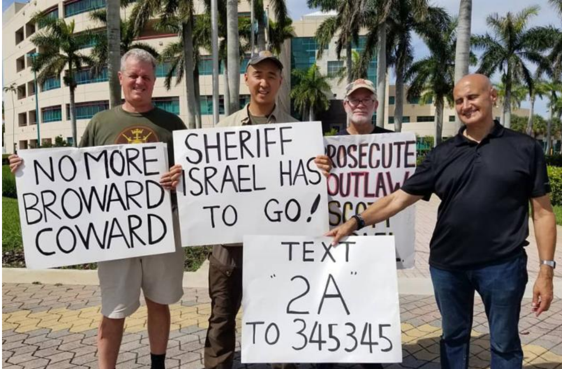
Rally at Broward County Sheriff's Office