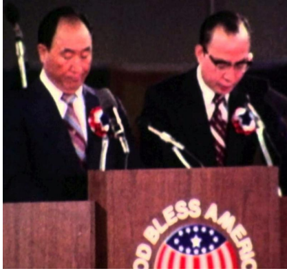
True Father Speaking at Washington Monument

Blessed are the poor in spirit, for theirs is the kingdom of heaven. Matthew 5:3