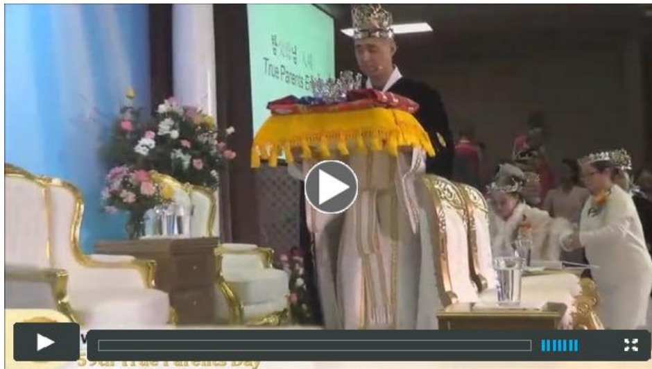
59th True Parents' Day, April 16, 2018, Unification Sanctuary, Newfoundland PA

On Monday, the 59th anniversary of True Parents Day was observed in a moving ceremony at the Unification Sanctuary in Newfoundland.