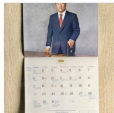
2017 Wall Calendar $25.00