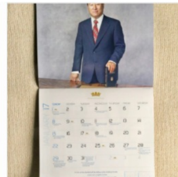
2017 Wall Calendar $25.00