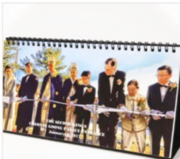
2017 Desk Calendar $20.00