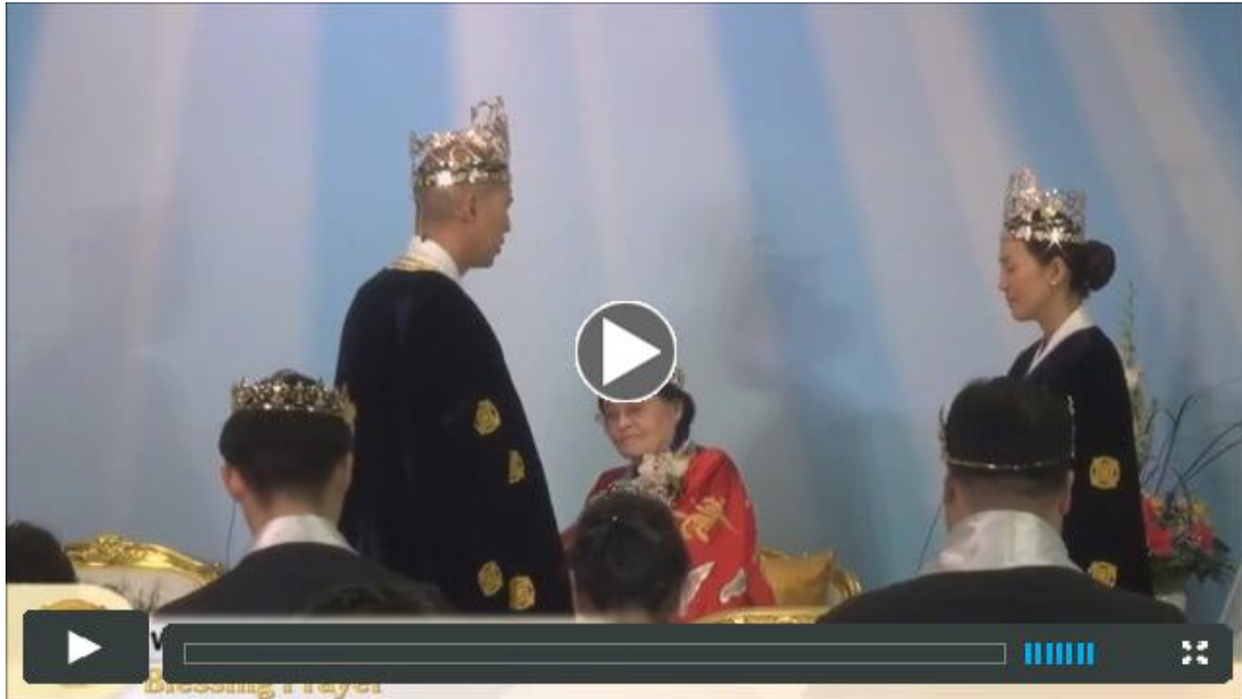
Cheon Il Guk Book of Life Registration Blessing Ceremony, Unification Sanctuary, Feb. 28, 2018

If you haven't seen today's moving, historic and heavenly Cheon Il Guk Blessing ceremony, I invite you to do so!