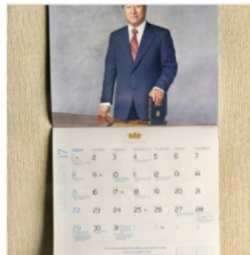
2017 Wall Calendar $25.00