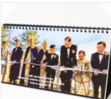
2017 Desk Calendar $20.00