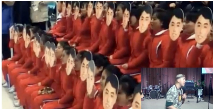
North Korean "Cheerleaders" Wearing Kim Il Sung masks at Olympics

Regarding the Olympics and the joint Korean Olympic team, Hyung Jin Nim noted the joint Korean delegation to the Olympics promotes unity, but centered on what? Father advocated unity based on acknowledgement of God-given, natural human rights, not satanic unity involving oppression of the masses except for an elite ruling class.