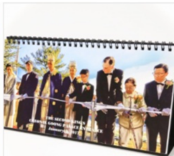
2017 Desk Calendar $20.00