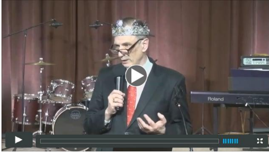
Sunday Service - February 4, 2018 - Unification Sanctuary, Newfoundland PA

At the present, the Blessing is being carried out within the Church because we do not have a nation, but in the future we need to be registered in the nation. You can be registered only when you have fulfilled your responsibility as tribal messiahs. By being registered in the nation and the world and becoming one with True Parents, then, with them as the subject and Blessed Families as the object partners, you need to dedicate your families to attend God. Only then can the cosmic ideal of Blessed Families be formed. Such is the Kingdom of Heaven on earth and in spirit world! Amen!