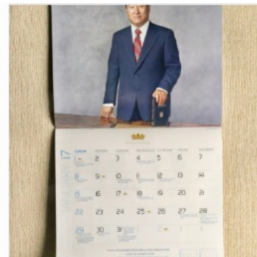
2017 Wall Calendar $25.00