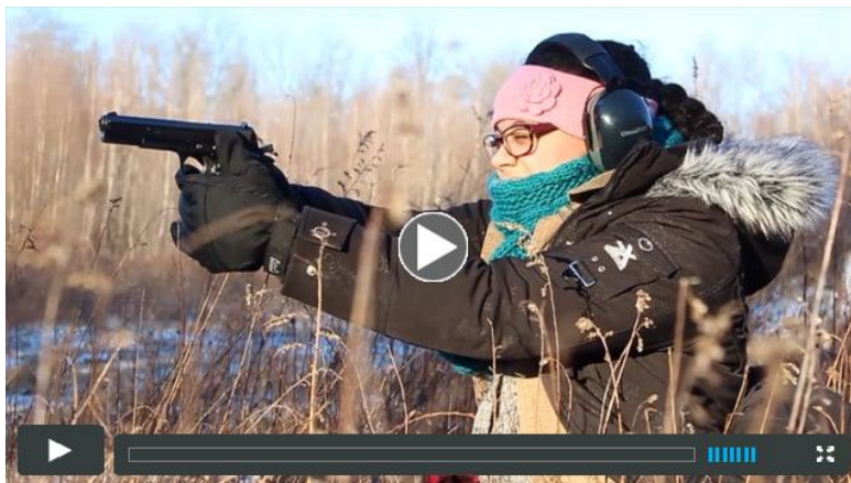
Peace Police Peace Militia Training for Self-Defense

In this context it is worth noting that governments have often been the largest violators of human rights, with an estimated body count of 260 million killed by their own governments in the last century alone. If necessary, citizens must be able to stand up to the power of government or other threats to their lives, families and communities.