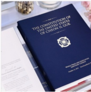
Cheon Il Guk Constitution