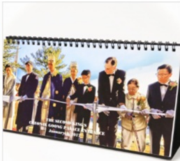
2017 Desk Calendar $20.00