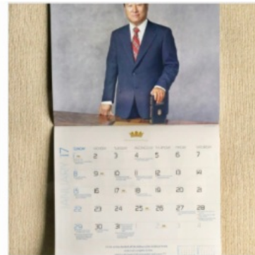
2017 Wall Calendar $25.00