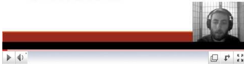
True Parents Way- The Road to Eternal Serfdom

True Parents Way THE ROAD TO ETERNAL SERFDOM