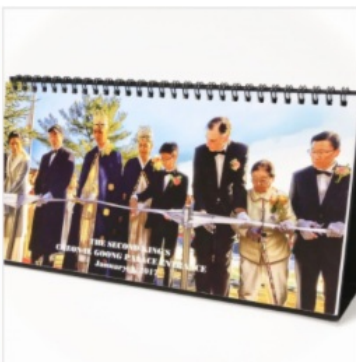
2017 Desk Calendar $20.00