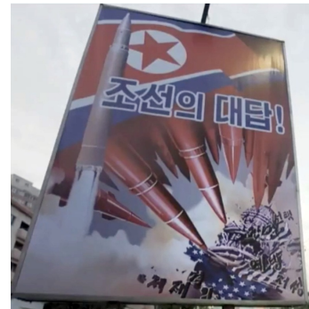
Poster of N. Korean missiles decimating the U.S. Capitol