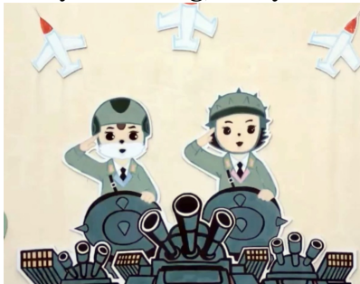
N. Korean Kindergarten poster

Marxists use a divide and conquer strategy to create false dichotomies and divisions between economic classes, rich vs. poor, men vs. women, etc. That way the population is easier to control. By controlling the culture, they dictate what you can say and indoctrinate our children. Social Engineers have contempt for Christian culture and seek to destroy it. When each man and woman are created in the image of God, they are harder to control.