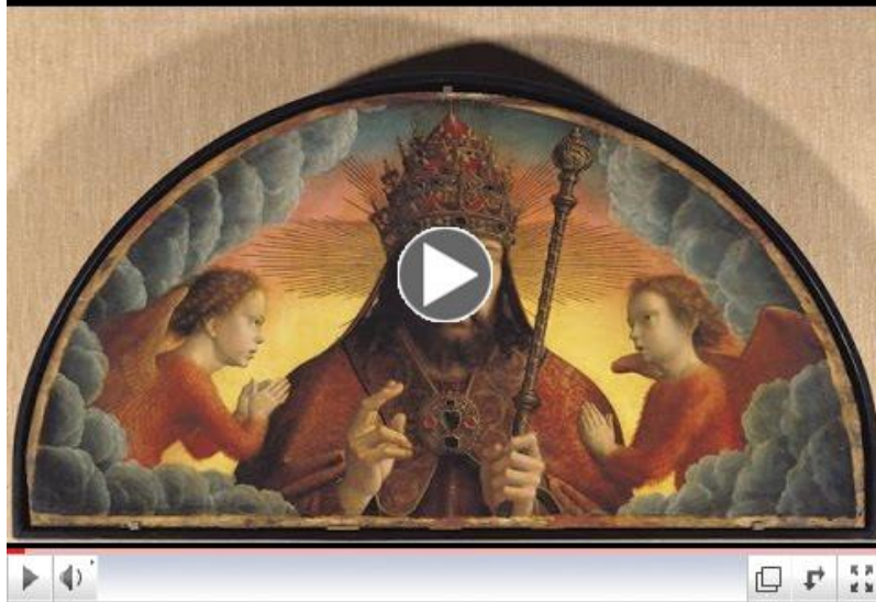
Jordan Peterson- Biblical Series I: Introduction to the Idea of God

Western civilization is based on Judeo-Christian perspective. In John 1:1 it states, "In the beginning was the Word, and the Word was with God and the Word was God." Because authority is invested in words, the tendency is to try to solve problems by debate about principles, not through violence. Without that there is no foundation for peace to exist. In the western world, reason, based on the Word is given serious weight. Not by power, where might makes right. In contrast Genghis Khan and many other leaders spread their kingdoms by their power of the sword.