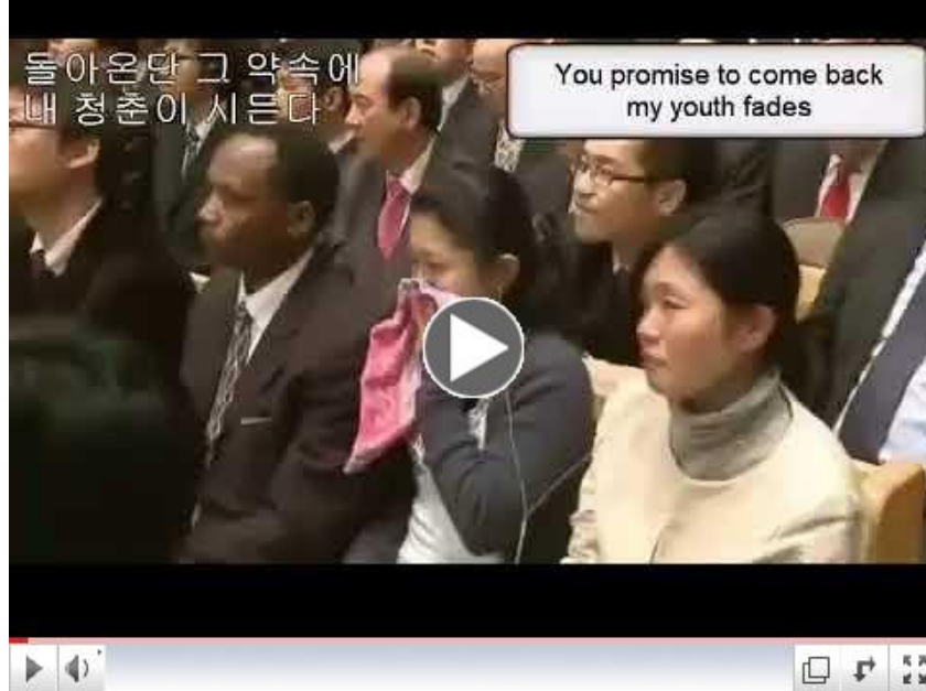
True Father on 3/7/2010 "I could not meet my bride."