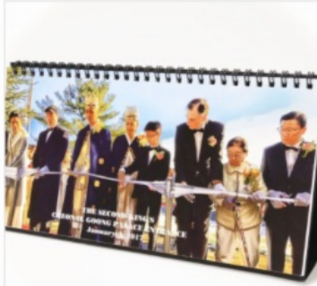
2017 Desk Calendar $20.00