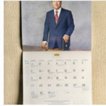
2017 Wall Calendar $25.00