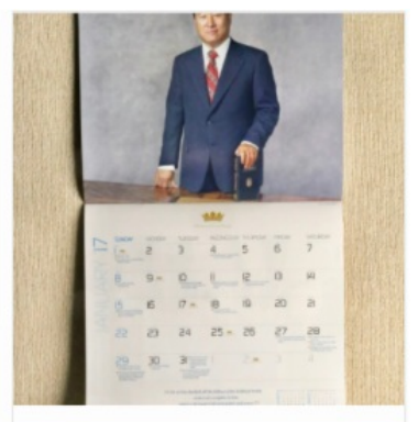
2017 Wall Calendar $25.00