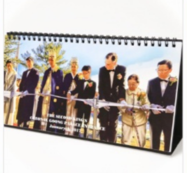
2017 Desk Calendar $20.00